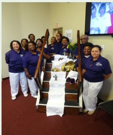
Worship Committee Team

Have you ever wondered what happens behind the scenes with the Worship Committee?